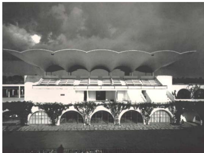
Figure 2. La Zarzuela Racetrack

All of the featured designs are presented in the book with construction photographs and drawings. These are seldom found in less thorough treatments of the master’s works and are most informative.