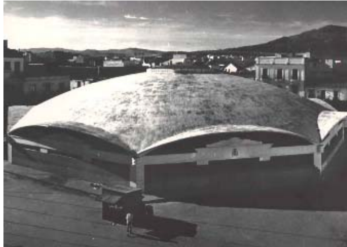
Figure 1. Martek Hall at Algeciras

The majority of this excellent document consists of detailed studies of ten or so built designs highlighting Torroja’s brilliance as a structural artist. One of my favorite structures is the 1933 Market Hall at Algeciras (See Figure 1.) It is a thin shell (Torroja’s favorite type of reinforced concrete construction) with a tension ring of 16 continuous rods around the edge to pick up the horizontal thrust. The central skylight is an elegant tracery of thin concrete mullions supporting the glazing. But the most distinctive feature is the presence of folded “eyebrows” over each of the eight entrances. The author correctly calls attention to the fact that the fold stiffens the edge of the shell while acting as an arch to direct the radial compression forces to the columns. I have recommended this edge condition (always crediting Torroja, of course) to many of my students over the years. In 1999, on the 100 th anniversary of Torroja’s birth, the Spanish government authorized an extensive restoration of this structure under the direction of Jose Antonio Torroja. That work was completed in 2003, and the Market is set to last another 70 or more years.